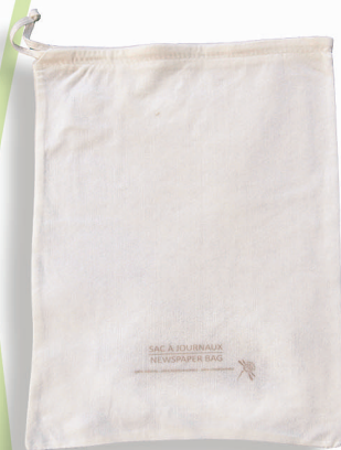
Sac Journaux classique