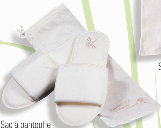
Sac à pantoufle