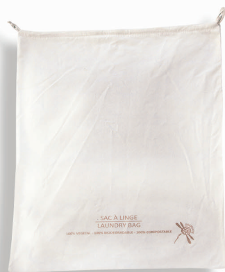
Sac à linge