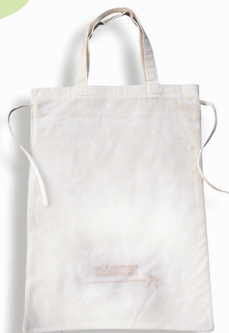
Sac Journaux à anse